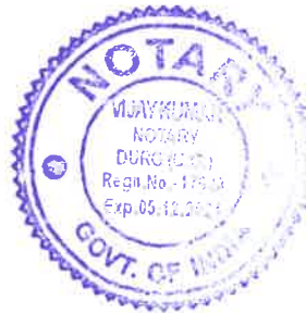
PHOTO COPY ATTESTED