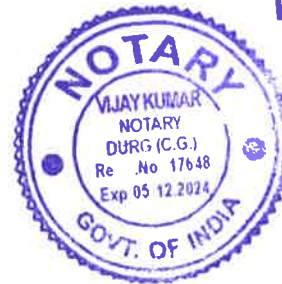
PHOTO COPY ATTESTED